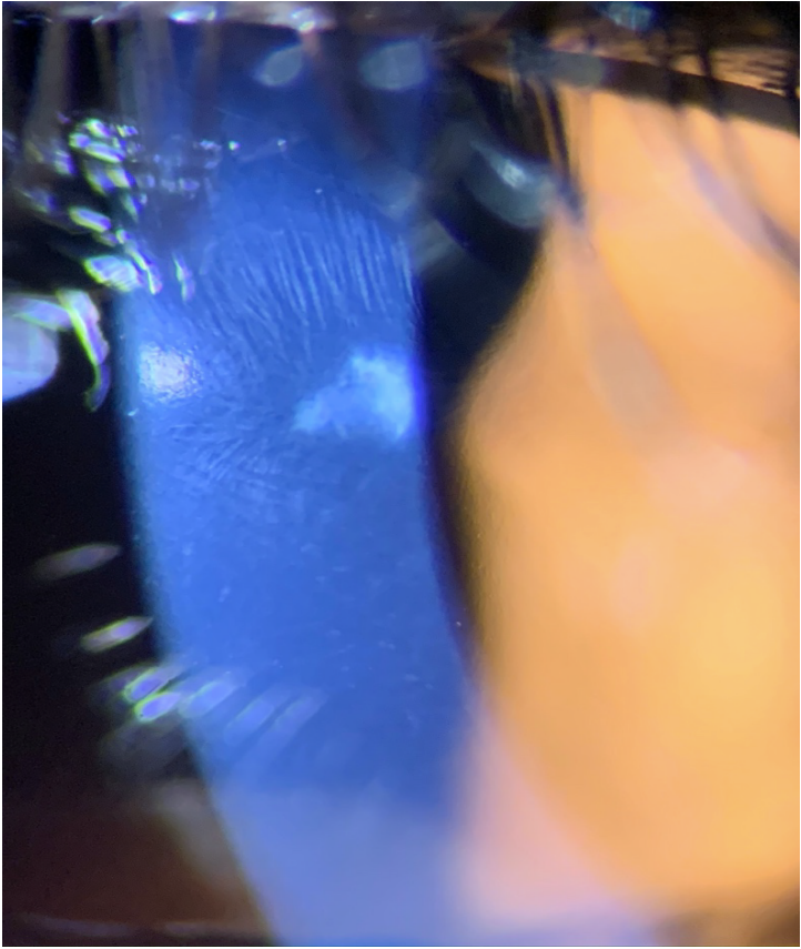
Small 0.3mm dense paracentral scar located just inferior to pupillary border with surrounding Vogt's striae